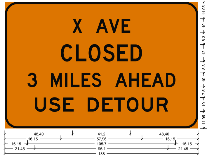
9.00" Radius, 1.25" Border, 0.75" Indent, Black on Orange