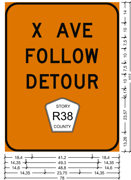
9.00" Radius, 1.25" Border, 0.75" Indent, Black on Orange