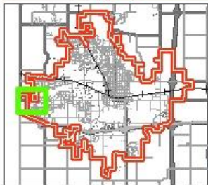
Location and Zoning Map 125 and 130 Wilder Avenue