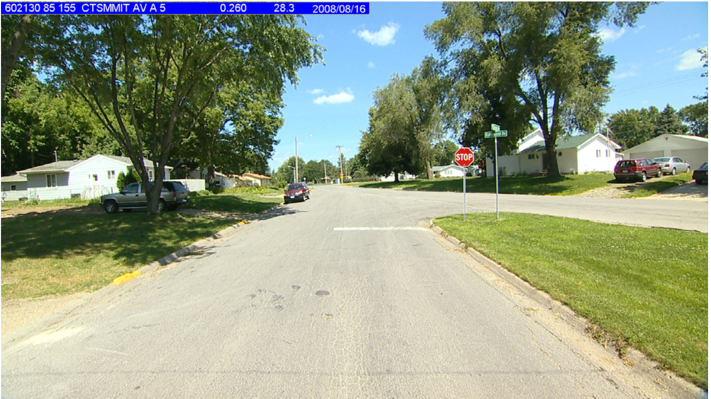
Summit Avenue Looking North