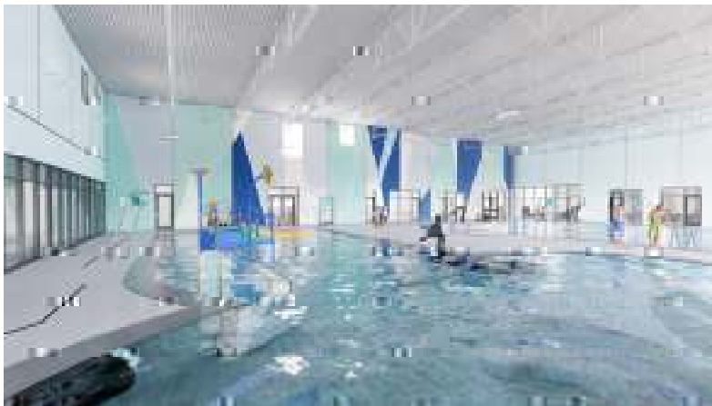
Zero-depth Entry Pool with Current Channel