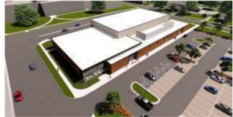
Rendering Looking Southwest