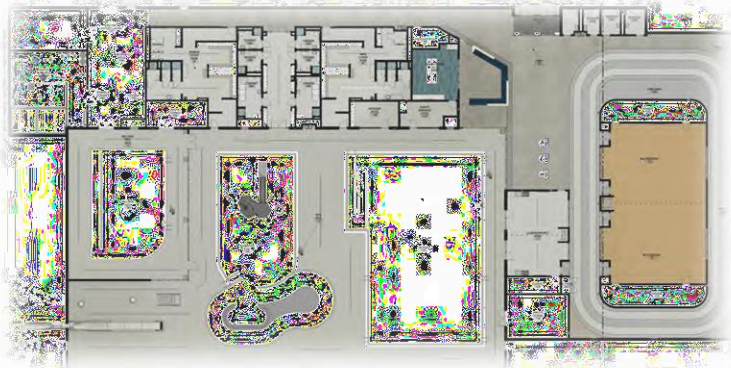
Conceptual Base Bid and Add Alternate Floor Plan