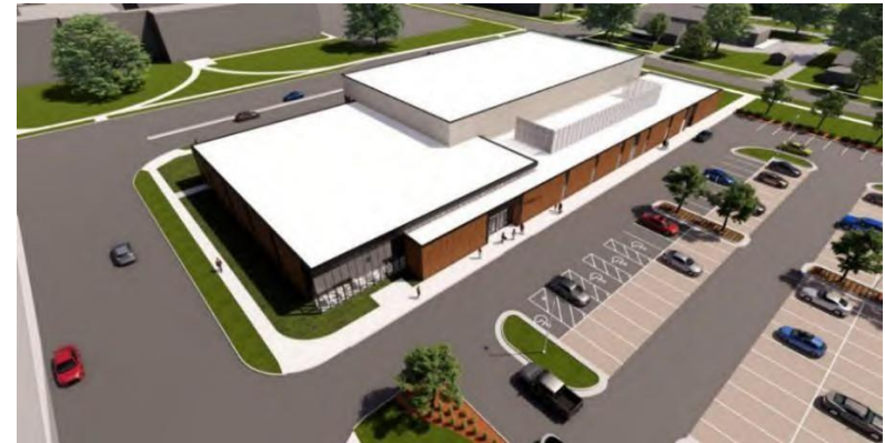
Conceptual Rendering of Base Bid and Add Alternate (Walking and Multi-Purpose Areas)