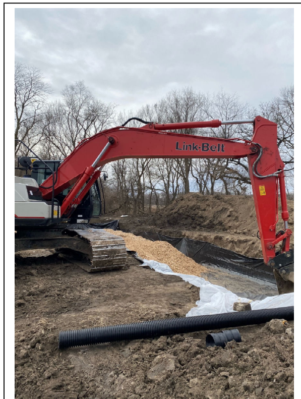
A bioreactor being installed as a part of Year 1 of the Story County Edge of Field project.

The success of the project’s first year was due in large measure to the collaboration between City staff, Story County, Story County Conservation, Story County Soil & Water Conservation District (SWCD), and the Iowa Department of Agricultural and Land Stewardship (IDALS). Staff from the Water & Pollution Control Department are again working in collaboration with these groups to develop a project involving 20 to 30 installations, each treating tile drainage from fields ranging in size from 20 to 100 acres.