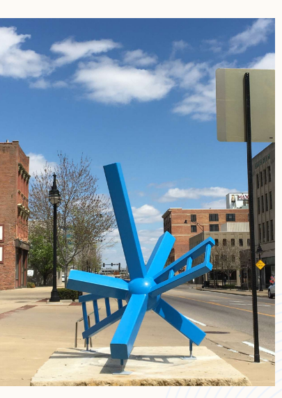
Dimensions: 5'x4'x4' Weight: 100 lbs Cost: $7,000 Year: 2016