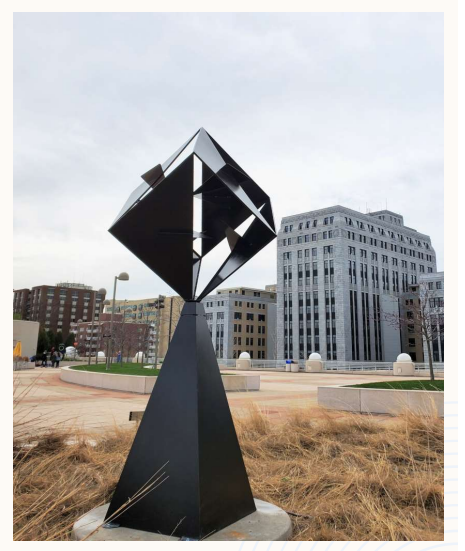
Dimensions: 96"x45"x45" Weight: 110 lbs Cost: $10,000 Year: 2020