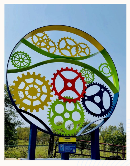
Dimensions: 9'x9'x3' Weight: 600 lbs Cost: $22,000 Year: 2019