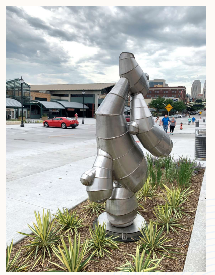
Dimensions: 80"x45"x30" Weight: 150 lbs Cost: $12,000 Year: 2020