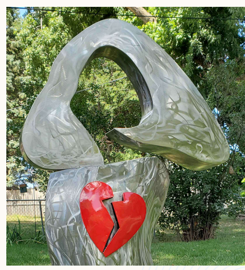
Dimensions: 57"x28"x34" Weight: 125 lbs Cost: $7,000 Year: 2022