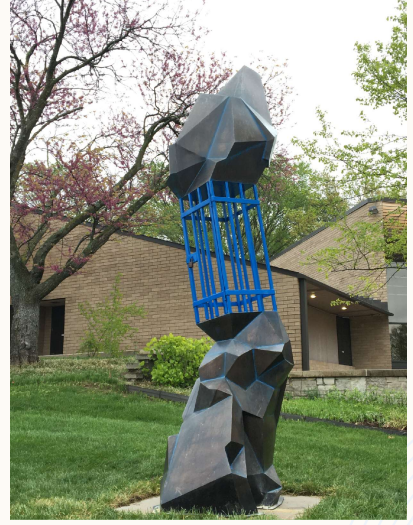
Dimensions: 10'x3'x3' Weight: 200 lbs Cost: $12,000 Year: 2015