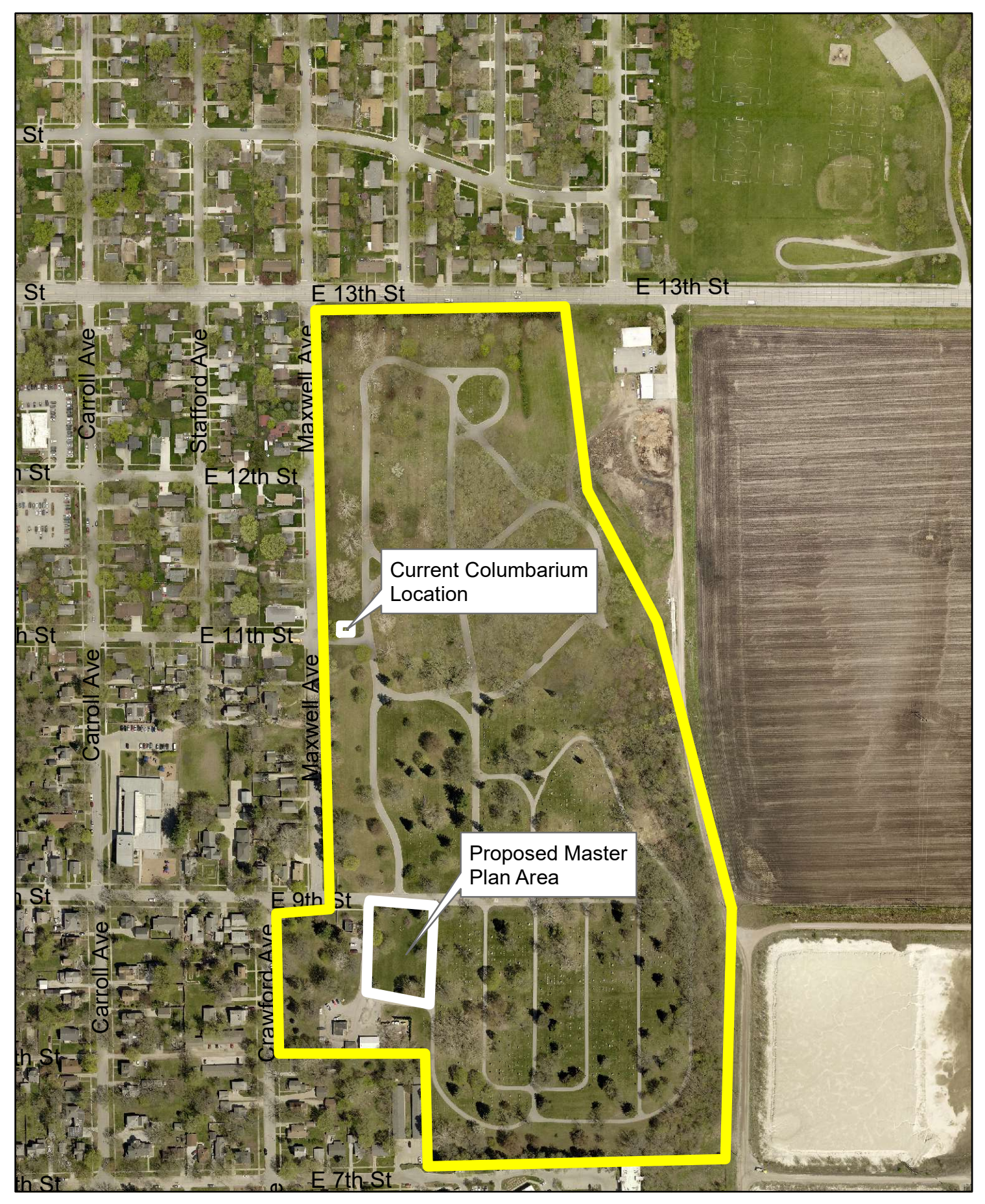
Attachment A - Ames Municipal Cemetery 301 E. 9th St.