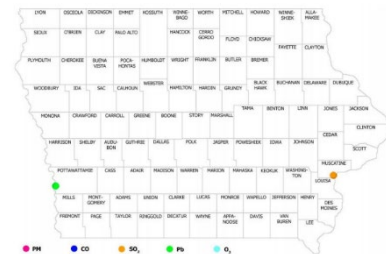
Figure 1. Iowa Non-Attainment

The Clean Air Act specifies how areas within the country are designated as either “attainment” or “non-attainment” of an air quality standard and provides the EPA the authority to define the boundaries of nonattainment areas. For areas designated as non-attainment for one or more NAAQS, the Clean Air Act defines a specific timetable to attain the standard and requires that non-attainment areas demonstrate reasonable and steady progress in reducing air pollution emissions until such time that an area can demonstrate attainment. Each state must develop and