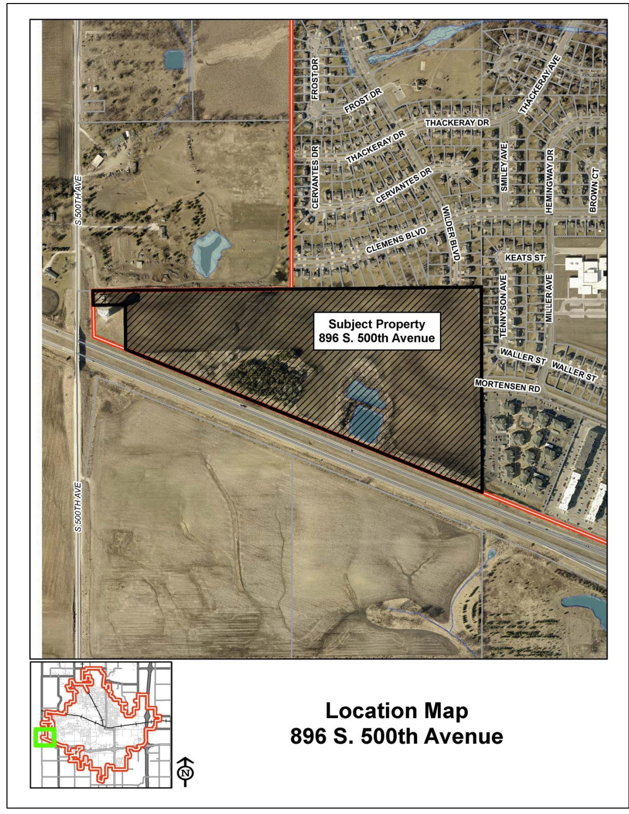
Attachment A-Location Map