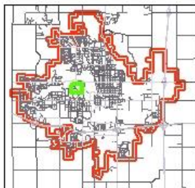
Location Map 131 & 137 Campus Avenue