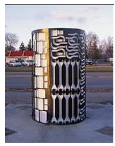
West Lincoln Way and South Oak St.