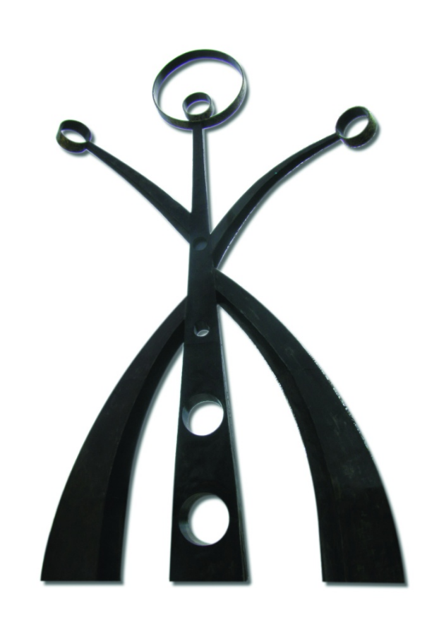
Just Between Thieves Jaak Kindberg