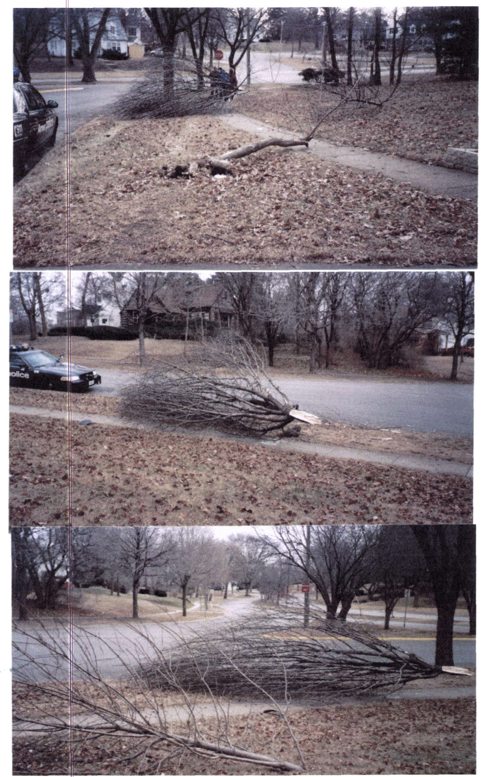
425 Pearson Avenue

The owners of the property at 425 Pearson about 15 years ago placed a large boulder between the street and their newly planted tree, which was replacing the tree hit by a speeding car. The city had the