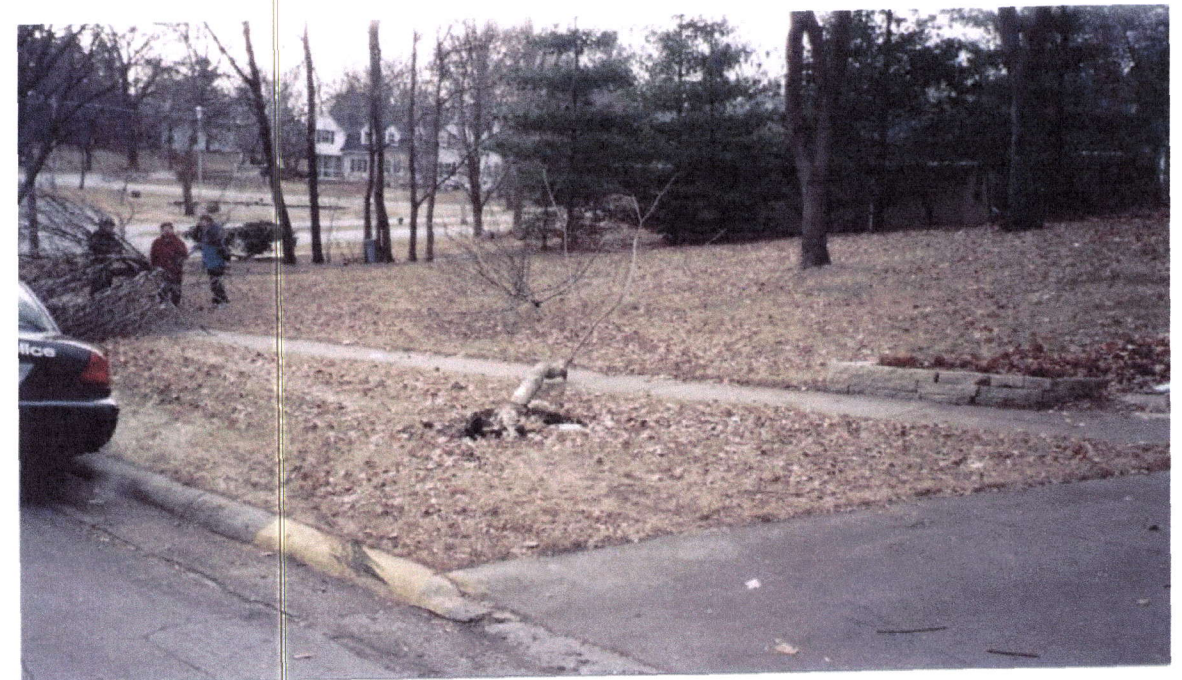
425 Pearson Avenue

Below is an accident scene at 425 Pearson Avenue.